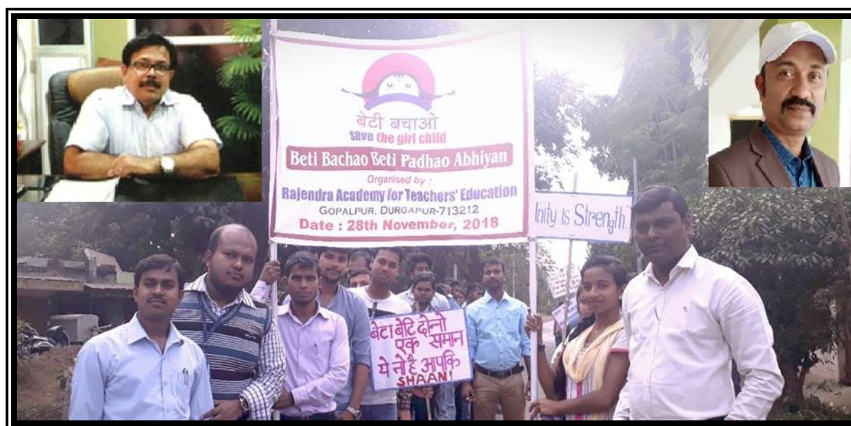
Minds behind the campaign