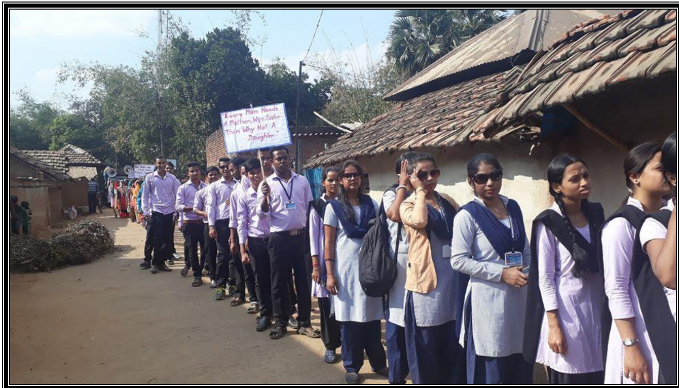
The students visited the surrounding village, Gopalpur